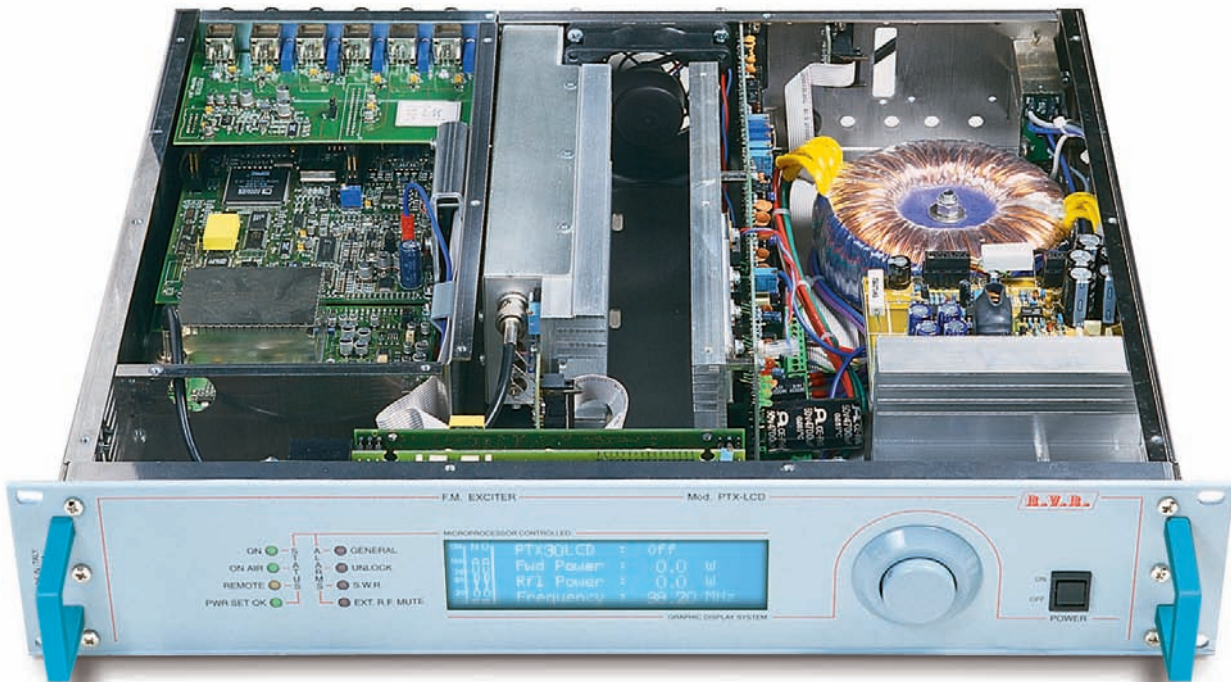
ANALOGICAL PTX-LCD internal view