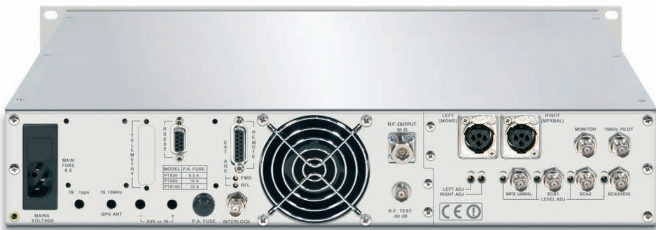
ANALOGICAL PTX-LCD rear view